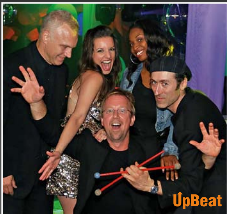
UpBeat at Chicago's Meeting and Hospitality Industry Bash, Crobar

UpBeat MUSIC PRODUCTIONS provides a comprehensive entertainment service, whether your event requires a full orchestra for dancing, a five piece dance group UpBeat, a jazz trio or jazz quartet for reception music, a string quartet for classical ceremony music, solo piano or strolling violin, a blues group, or a custom theme for a corporate gala. We know how important your special event is – creating just the right party atmosphere is what we do. Outstanding musicianship will make the difference for your special event – our artists create a distinctive, unforgettable party atmosphere. And, we are also a group of really fun people!