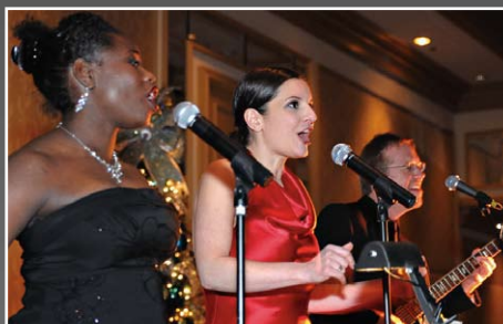
MCO at Renaissance Chicago, Grand Ballroom