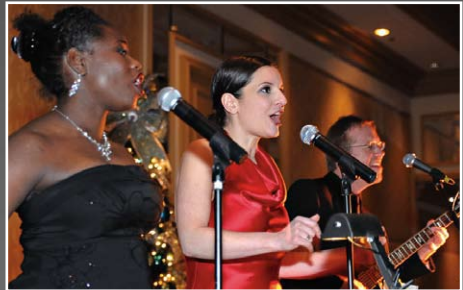
MCO at Renaissance Chicago, Grand Ballroom